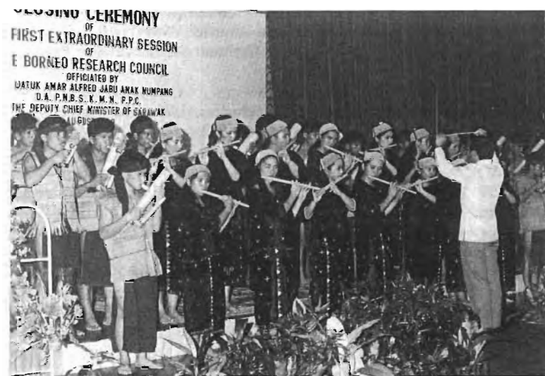
Entertainment by The Bamboo Band from Lawas